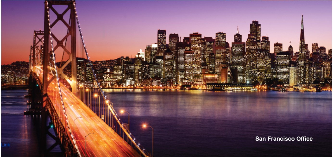
San Francisco Office